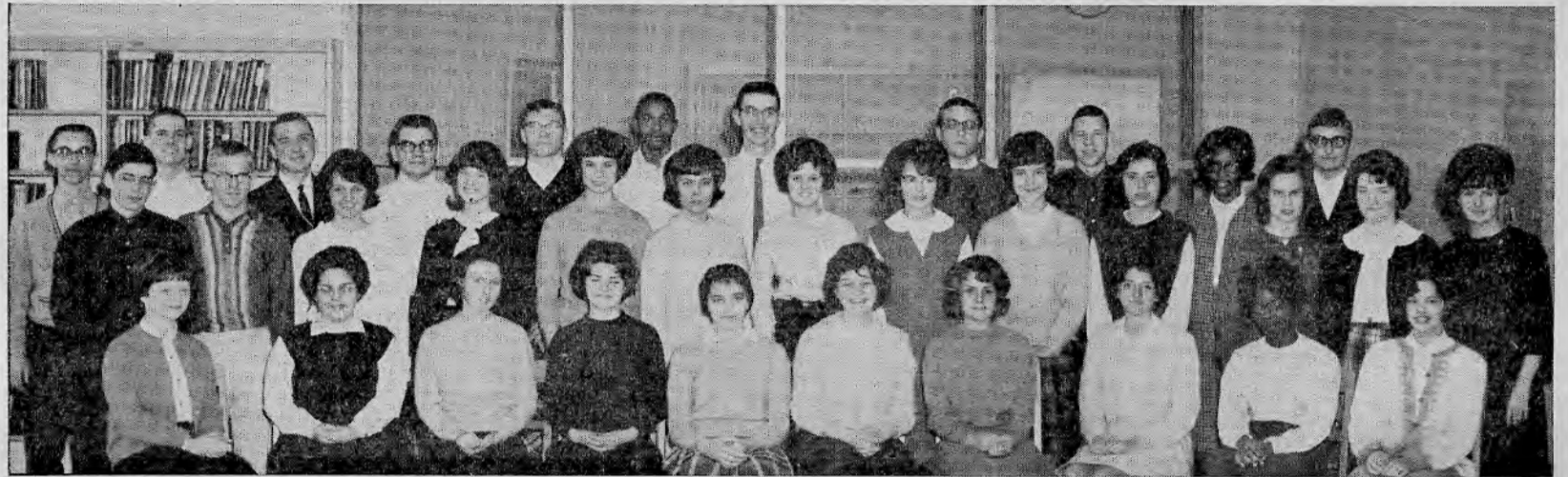
Here are the new National Honor Society members recently inducted into the Washington High School chapter. Congratulations to each of the new inductees!

This Spring Carnival will certainly be loads of fun, but it will require cooperation on everyone's part to make it a success.