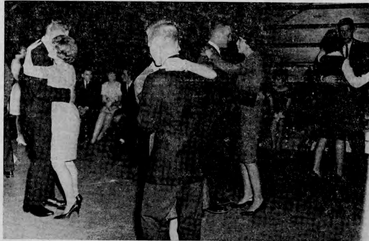
JUNIORS ENJOY DANCING AT JR. CLASS PARTY