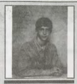
My New Year's resolution is to get better grades and to eat more cheese because it is good for me.