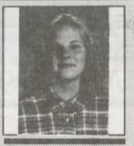
My New Year's resolution is to stop making resolutions that I can't keep.