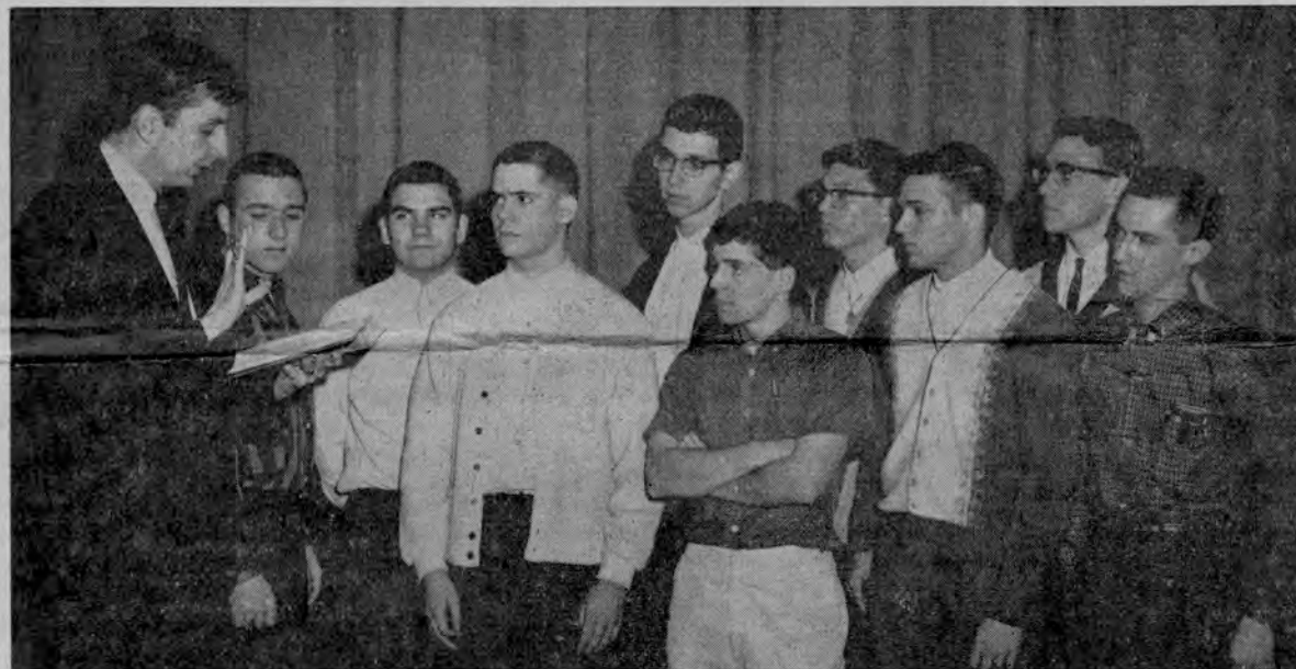
TRYOUTS FOR G. WASHINGTON'S BIRTHDAY PROGRAM?