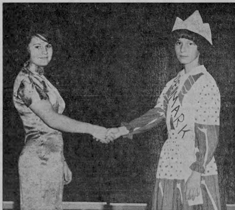
OUR FOREIGN EXCHANGE PROGRAM?